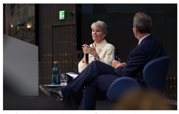
Hilary Charlesworth, Judge at the International Court of Justice, at the opening of the Academic Year on 25 September 2024.