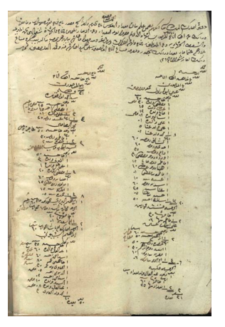
Figure: Page 1 of the population census register of the village of Bigirim wa Kafr al-Sheikh Mansour, Al-Gharbiya province, 1847