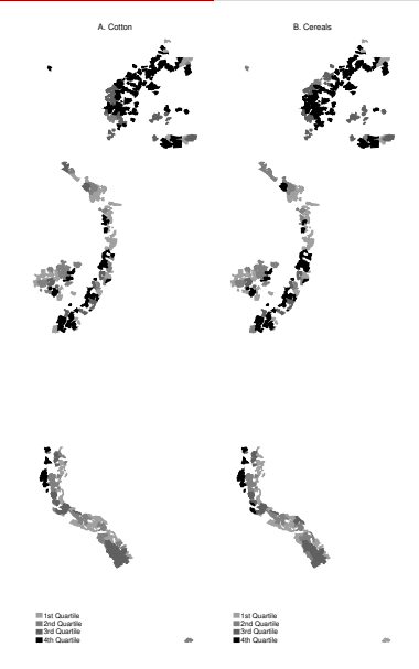
Figure: Cotton and cereals suitability indices of villages in the matched districts

Saleh (TSE & IAST) Export Booms and Labor Coercion May 26, 2020 27 / 49