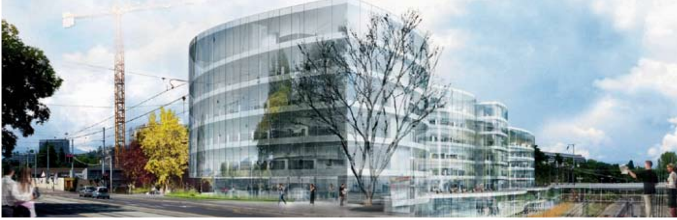
Future "Maison de la paix"