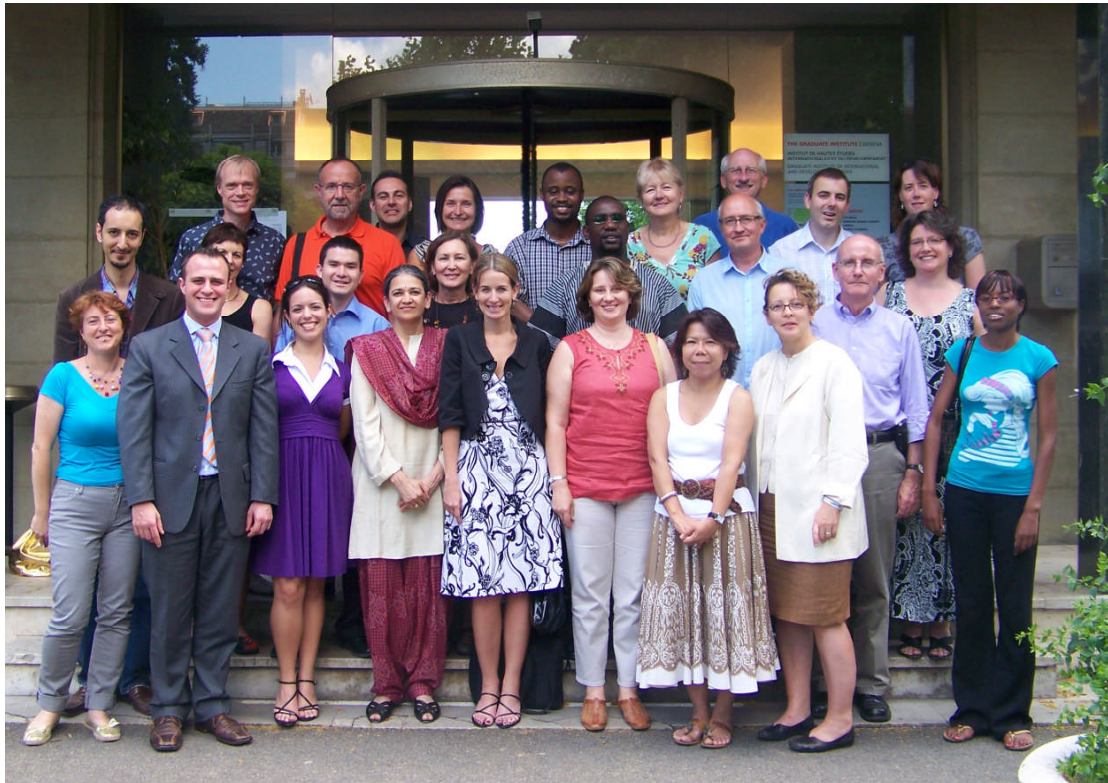
Group Photo – Executive training in Global Health Diplomacy 2008

The executive training course on Global Health Diplomacy was held from 23 – 27 June 2008 for the second time at the Graduate Institute of International and Development Studies in Geneva. 26 professionals from 21 different countries have successfully completed this executive training course. The participants came from diverse professional backgrounds: Health experts from ministries of health, diplomats and health attachés, staff from international organisations and non-profit non-governmental organisations participated in the course. Indeed, this diversity of