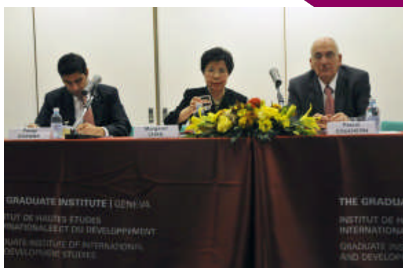
Photo: Symposium 2008